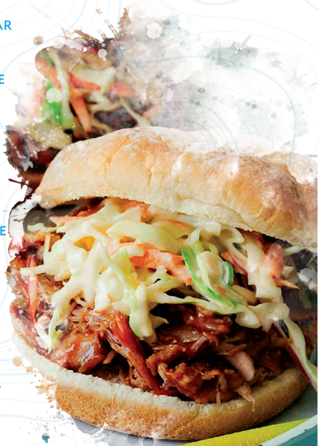
BBQ Pork Sandwich Dinner Special // Hideaway Grill at Sunset Lounge