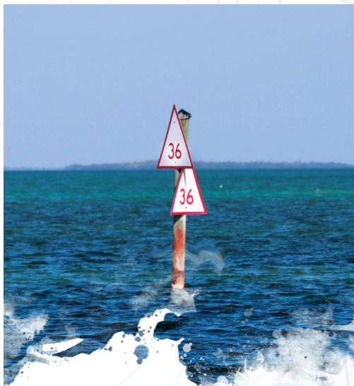
Dredgers Key Channel Marker