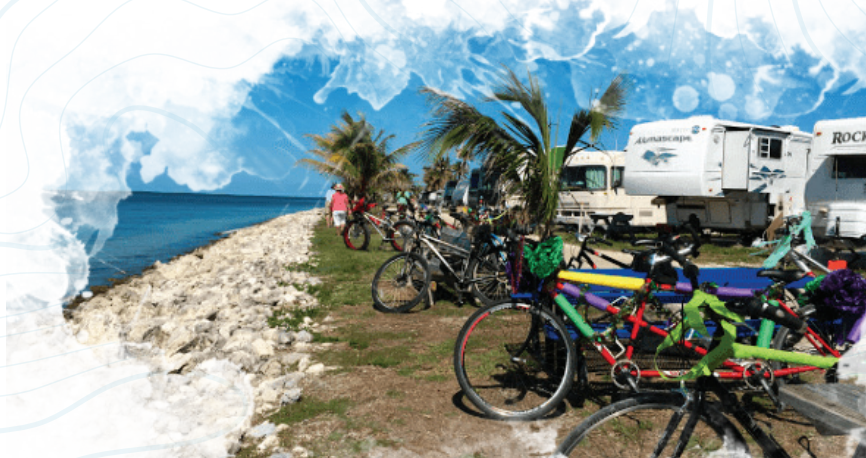
Sigsbee West, Sigsbee Park Campground