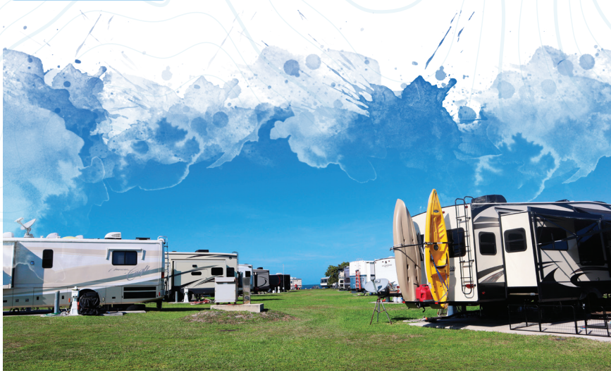
Sigsbee Gulf View, Sigsbee Park Campground

Use of an exhaust stack that is properly installed, fastened and safely operational.